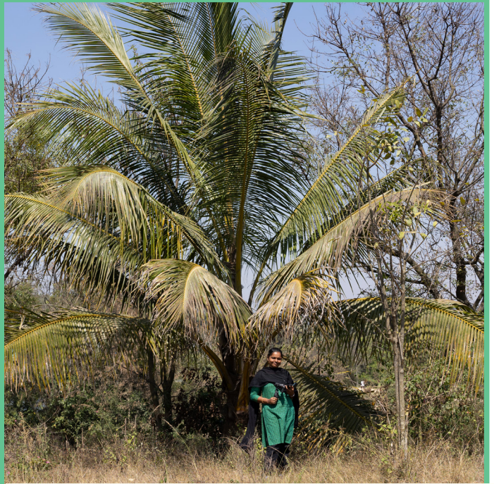
MASARD staff, Nandhini, under 5-year-old SOTE tree at Ashagram compound