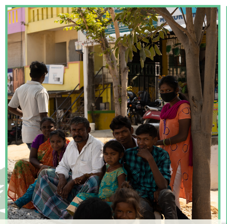
Local villagers waiting for bus in the shade of 5-year-old SOTE tree outside RDC

As well as tree planting, MASARD set up 12 new impressive kitchen gardens in 2022. Some new gardens are currently on their second and even third crop! These gardens take MASARD's total up to 39, and are providing people with regular nutritious foods, incomes, and a sense of purpose. Billie and Lena visited several gardens and were moved by the stories of the participants. MASARD also ran two general environmental campaigns with an average of 300 people attending each, and 15 village level campaigns with around 15 attendees, to continue to motivate people to care for their plants organically.