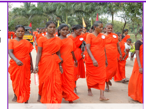
A march for women's rights, early 2000s

From 2020-2021, we launched two emergency appeals to provide aid during India's Covid crisis. The appeals raised over £80,000 and provided food, water, medical support and hope to many thousands of marginalised families. The appeal funded extracurricular schooling that taught and fed children for 18 months in the complete absence of government education.