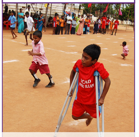
Sports day at a residential school

In a society where most live hand to mouth in poverty, the plight of the disabled is even more difficult. What little government money there is available is often impossible to access because of ignorance and illiteracy and job opportunities are extremely limited. Parents of children born with disabilities are often ostracised leaving them without help of any kind.