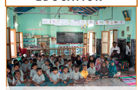
New granite floor in primary school