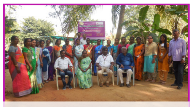
Health care workers and training staff

In February, CRUSADE staff and village health care workers attended a three-day mental health training course. A team from SCARF (Schizophrenia Research Foundation) in Chennai, led the programme. Training covered addictions, symptoms of mental health, coping mechanisms, and misconceptions. Attendees reported that the training offered good exposure to mental health concerns, and animators reported that they felt more comfortable identifying and supporting concerns in the future.