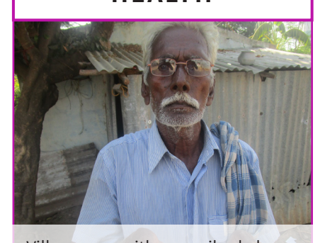
Village man with prescribed glasses

Healthcare services in many rural villages were non-existent when we started. Now, with your support, access to healthcare for over 100 rural communities has been created by mobile clinics staffed by qualified doctors, with free medicine provided for those who cannot afford it. Two Jeeps were purchased for these clinics, thus enabling patients to get medical help without travelling many miles and giving up a day's pay in order to go to a government health centre.