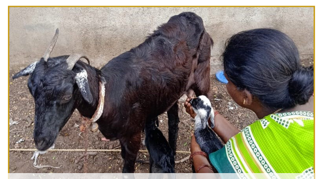
Project participant helping baby goat feed

Last year, CARE provided begging families with three goats each. Goat rearing was an income-generating project requested by the local people, and participants have taken to the challenge with enthusiasm. In late 2021, the first round of goats produced kids, which meant that the scheme could expand to neighbouring villages. For each three kids born within the programme, one kid is given to a family on the waiting list.