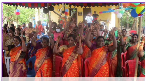
Women's Day celebrations in action

CRUSADE celebrated International Women's Day on 19th March at their community kitchen compound. The 80 attendees included self-help group members, CRUSADE staff, health care workers and special guests from the Panchayat and local universities. The event featured speeches from local dignitaries, poem readings, and celebrations of CRUSADE's recent achievements. Man Vasam, (meaning 'The smell of the Earth') a cultural group from Chennai Loyola College, entertained the audience with a folk arts performance.